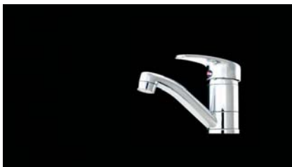
99075-Solo Short-spout vented mixer tap