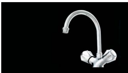
99076-Mono Tall-spout vented mixer tap

See installation instructions for full warranty details.