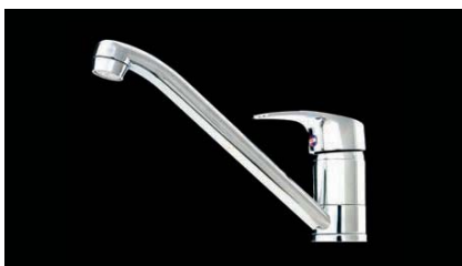
99051-Hero Long -spout vented mixer tap