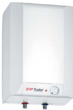
10L over-sink model

Over-sink or Under-sink Water Heaters 5.0 litre, 10.0 litre Open Outlet to Single Point