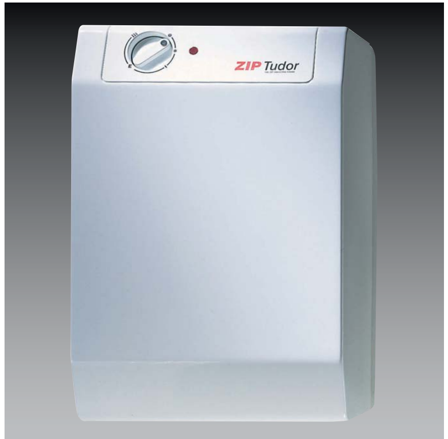
5L under-sink model

See installation instructions for full warranty details.