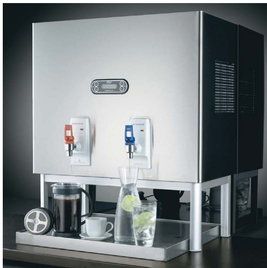
Zip Duo on stand with drip tray offering both boiling and chilled filtered water.