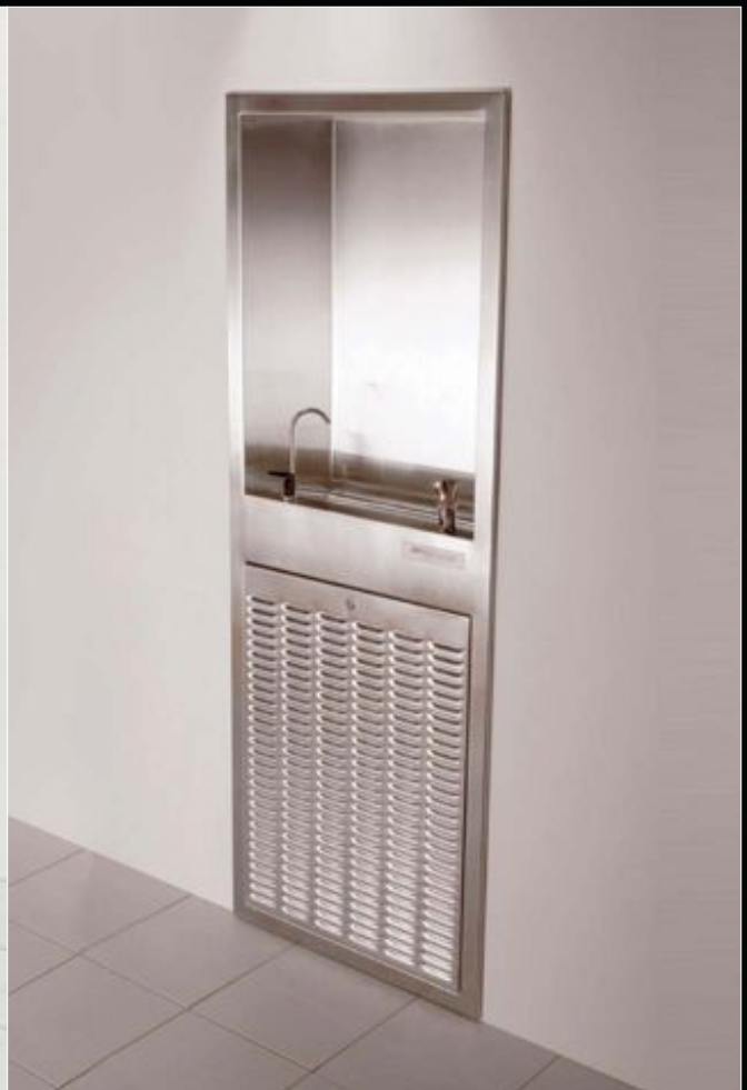
Zip Wall Fountain