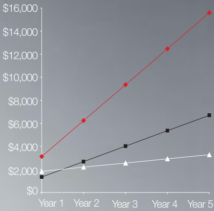
Cost Comparison of Bottled Water vs Zip Chilled Water over 5 years

And compared with bottled water Zip systems deliver chilled filtered water at a fraction of the price of bottled water. The following table compares the costs.