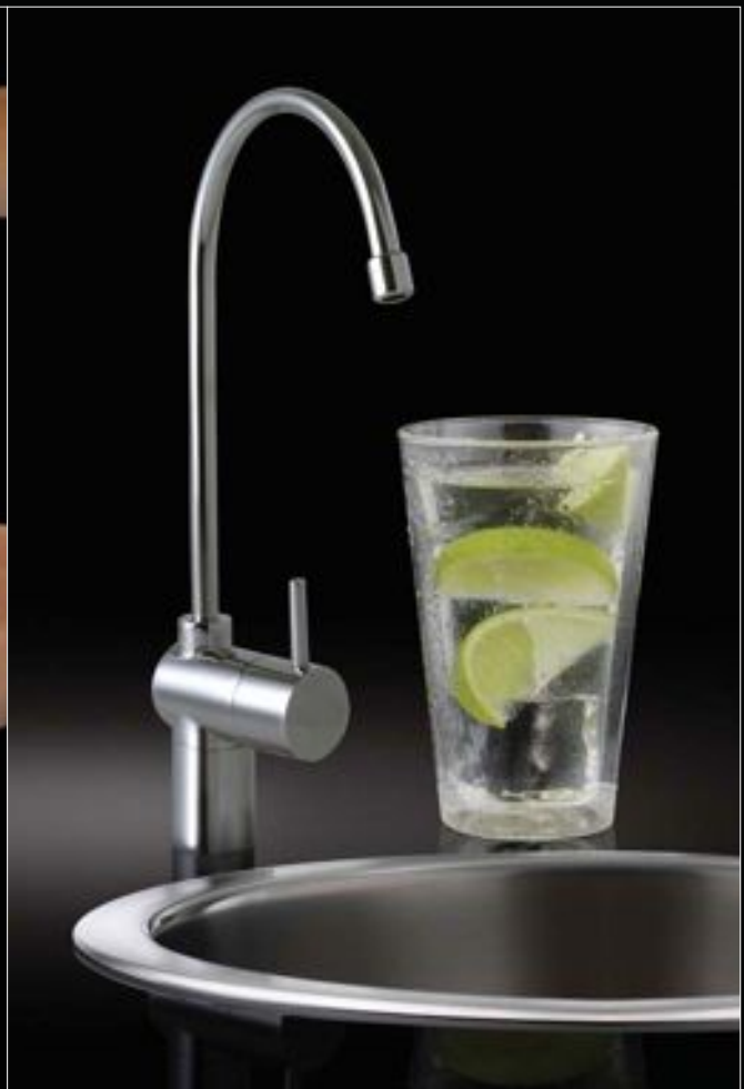
Zip Filter/Chill Tap